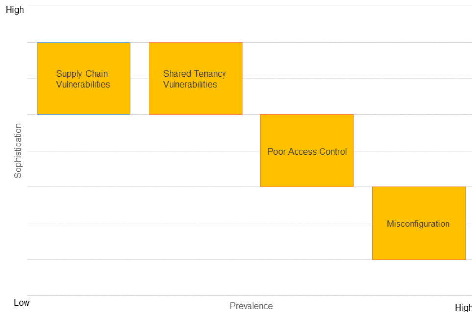
Figure 2: Cloud Vulnerabilities – Prevalence versus Sophistication of Exploitation

Mitigating cloud vulnerabilities is a shared responsibility between the CSP and the customer organization. Critical to an organization’s success in both transitioning to the cloud and maintaining cloud resources is support from informed leadership, which ensures the right governance, budget, and oversight. With this support, administrators are able to enable effective mitigations for cloud resources. Cloud technology moves rapidly, making oversight a complex task. Organizations need dedicated resources commensurate with the size of the organization to ensure adequate protection in the cloud. Additionally, customers should work with their CSPs to understand available vendor-specific countermeasures and their impact on risk.